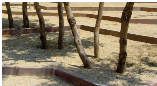
TREES IN STEPPED GRAVEL