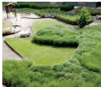
FREEFORM PLANTING BEDS