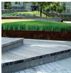
PLAYFUL USE OF MATERIALS AND LEVEL CHANGES